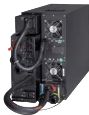
9PX 11kVA with Maintenance ByPass