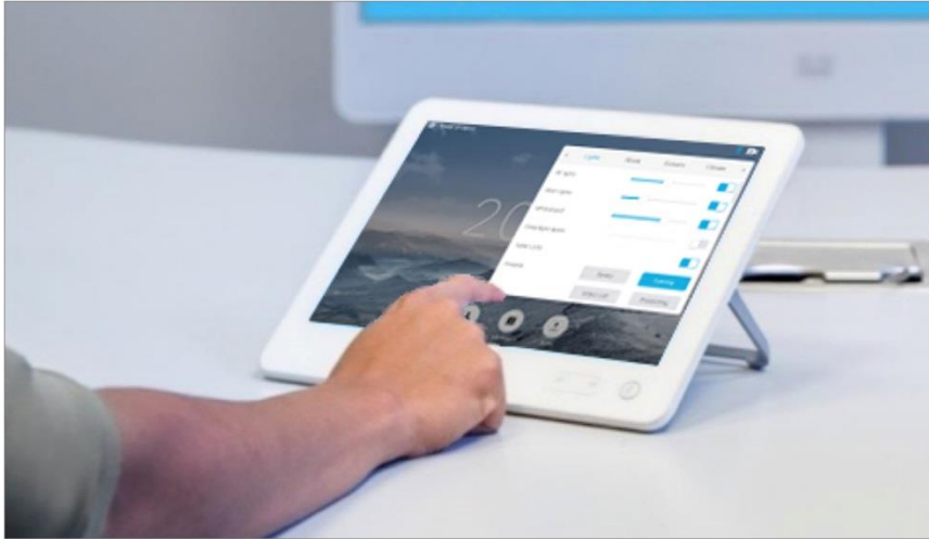
Figure 2. User Interface Displaying In-room Control Information

Table 1 gives specifications of the Cisco Touch 10 control unit.